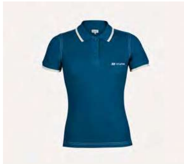
Polo shirt, women

Wherever you go, you'll cut quite a figure in these stylish complementing garments. A Hyundai collection made to match any weather condition. Worn according to the onion principle, you'll ride out whatever the skies send after you. Whether you're exploring a canyon or a city – you'll be able to adapt to wind, rain, sun and cold.