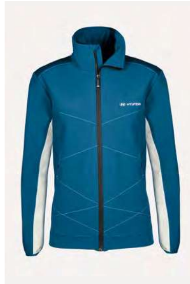
Softshell jacket, men