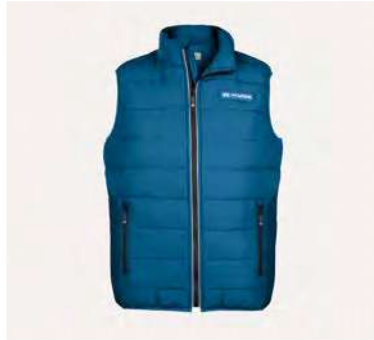
Down vest, unisex