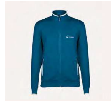
Sweat jacket, men