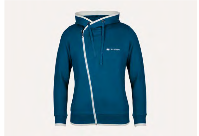
Sweat jacket, women