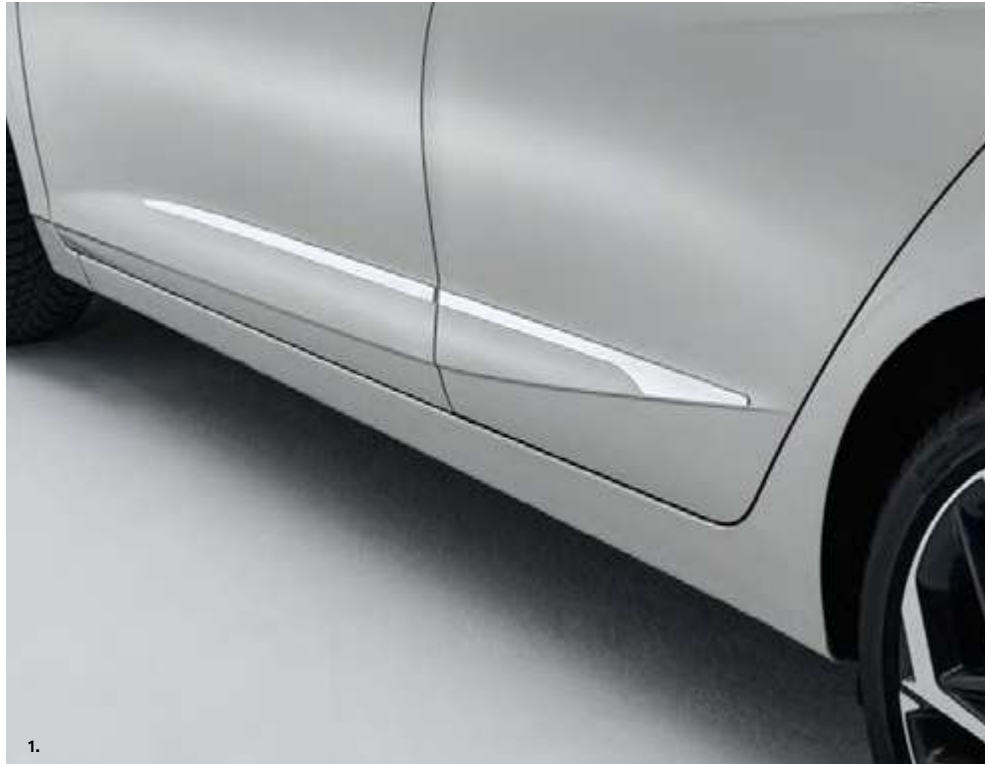
1. Side trim line Bring more premium dynamism to the side panels of your i20 with these high-gloss stainless steel side trim lines. Q0271ADE00CL