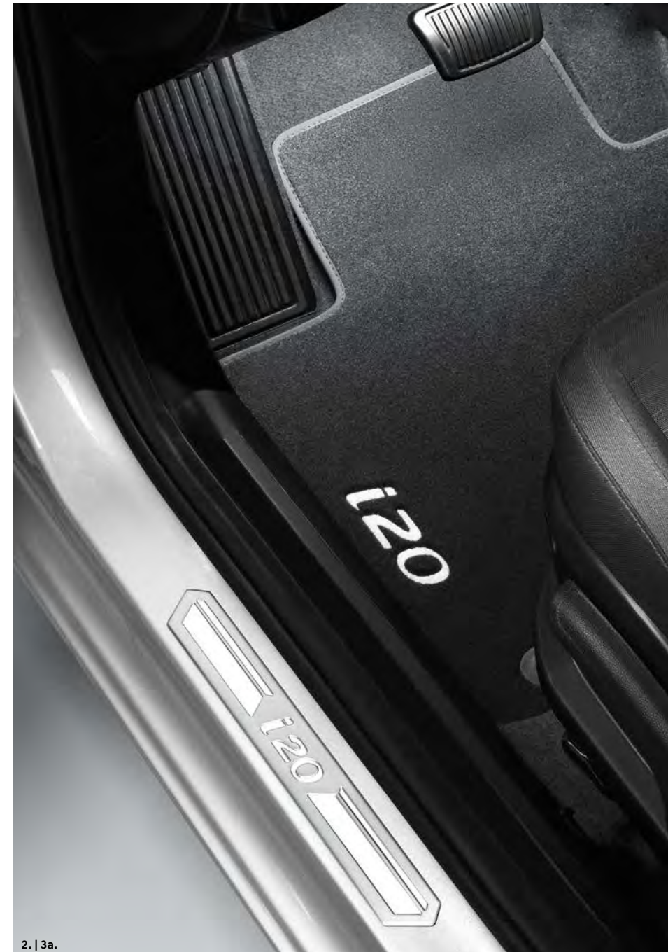
2. | 3a.