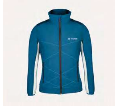
Softshell jacket, women