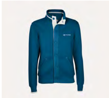
Sweat cardigan, men