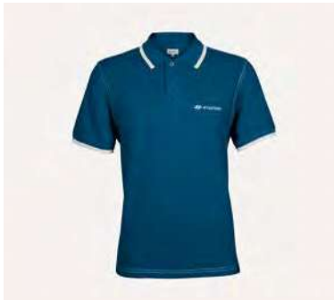
Polo shirt, men